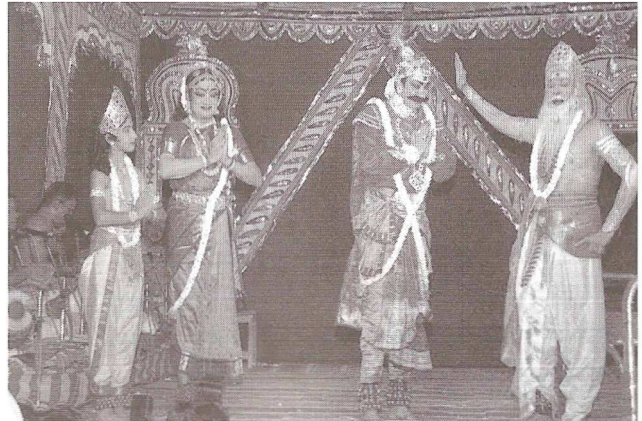
A scene from Prahlada Charitam